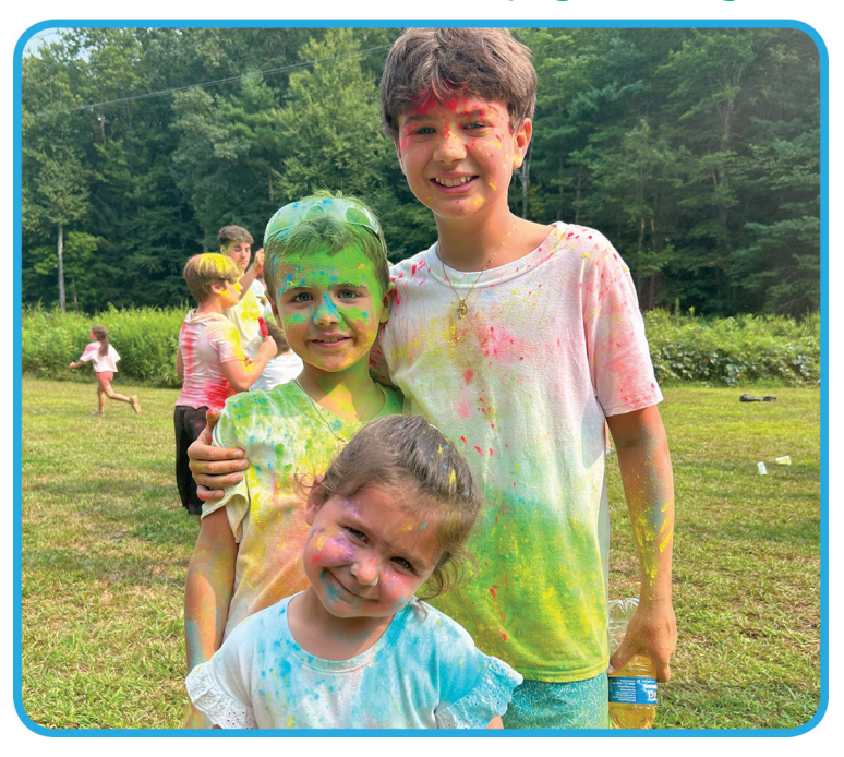
"I love it, it's the best place ever" - Age 8

"It's amazing, you learn so many new things about yourself that you didn't even know you could do...meet new friends...it's the best place on earth...how many days until camp?" - Age 10