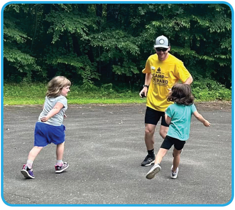
"My camper loves it because "it's so fun every day." I love it because she has become a more confident swimmer and is trying new things."