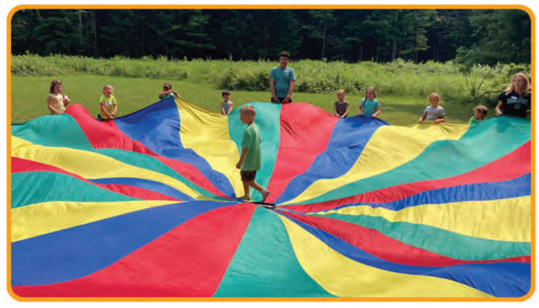
SPARTANS: Ages 7, 8, 9 • Grades 2, 3, 4 & TITANS: Ages 10, 11, 12 • Grades 5, 6, 7

Campers in the Teen Leaders Group participate in camp activities at a higher skill level. Special projects, trainings and activities such as mountain biking, hiking, high and low ropes adventure are included in this fun and challenging teen program. This program also involves developing leadership skills, including communication, decision making, conflict resolution and more. With a focus on the YMCA's Core Values of Caring, Honesty, Respect and Responsibility, group members will develop skills through teambuilding challenges, individual values exercises and group discussions. During their last years as campers, our staff will balance fun, personal development and leadership exercises to ensure all campers have the best summer ever! It's the last year to enjoy camp as campers while starting to make the transition toward greater responsibility.