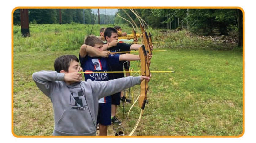
TEEN LEADERS: Ages 13, 14 (co-ed) • Grades 8, 9

This program is especially designed for the younger camper and maintains a 5:1 camper to counselor ratio. All campers in this group will participate in activities specially geared to their age level. Their experience mirrors the same activities as the older groups, participating in swim lessons, recreational swim, arts and crafts, ropes, kayaking, nature, sports, at an age appropriate level. We also build in longer transition periods, story time and activities specifically designed for our youngest campers.