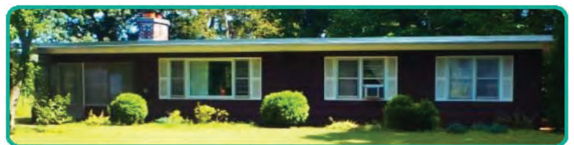
Camp Office or "Brown House" - 360 Northwest Rd Used for Pick Ups and Drop Off, 9:30am-3:30pm

Go past the YMCA on Court Street towards Westfield State University. Court Street becomes Western Avenue. Go past the University and bear left at the fork onto Upper Western Avenue. Take a left onto Northwest Road. Camp Shepard is at 370 Northwest Road (on the left).